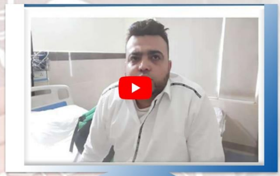
Patient with Diabetes Mellitus and Neuropathy shares his experience at SCCI| stem cell therapy