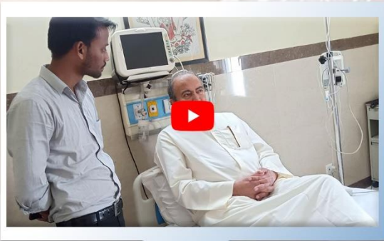
Patient with Diabetes Mellitus and Neuropathy shares his experience at SCCI| stem cell therapy

▶ https://www.youtube.com/watch?v=HHXbiHmUd4c&list=PLELQLL6bv4tXBHUK7AKuexKnWsQ3htznJ