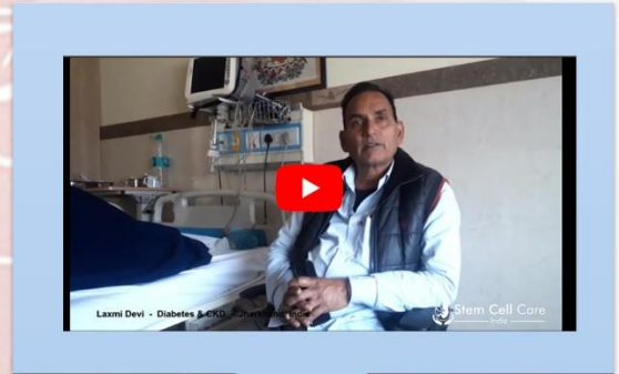
The patient husband shares his experience after stem cell therapy for Diabetes & CKD| Stem Cells

▶ https://www.youtube.com/watch?v=6LU7WPX6BTU&list=PLELQLL6BV4TWUW9JOFW87TG3ZJR8LCDYI&index=2