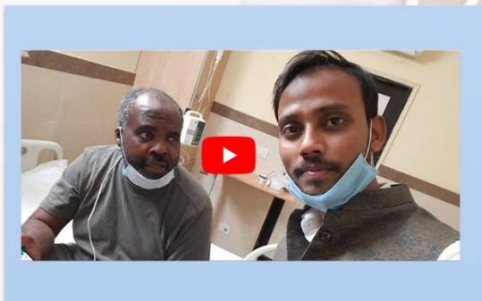
PATIENT WITH GLAUCOMA AND RETINAL DETACHMENT SHARES HIS EXPERIENCE AT SCCI| STEM CELL THERAPY

▶ https://www.youtube.com/watch?v=X7cMkZC_YxU&list=PLELQLL6bv4tVUydsR01jsHDTdZpc13fL8